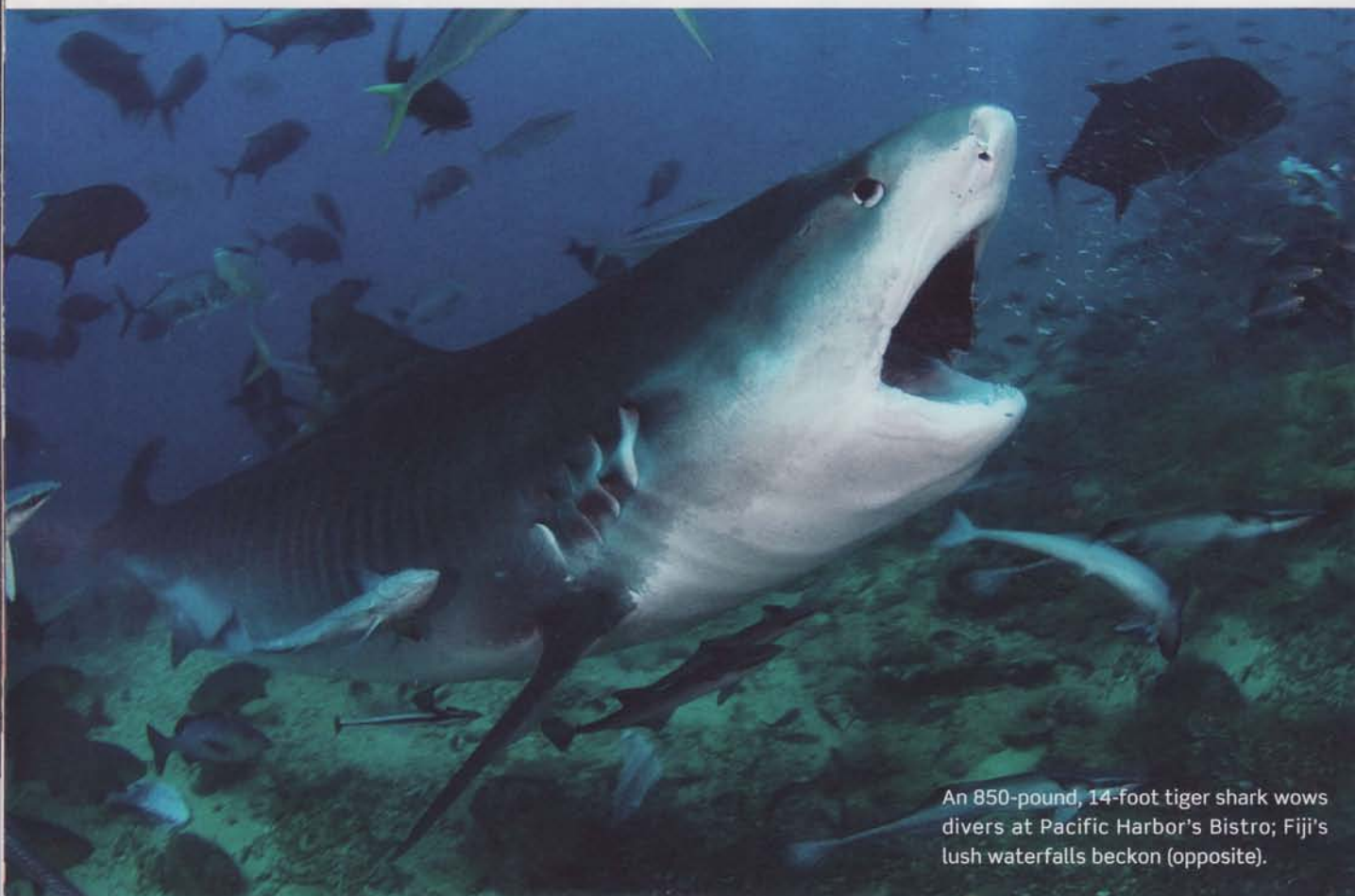
An 850-pound, 14-foot tiger shark wows divers at Pacific Harbor's Bistro; Fiji's lush waterfalls beckon (opposite).

In most cases, these reserves have been established in shallow fishing areas near shore. About a dozen also are dive sites, in many cases set aside to attract traveling divers whose donations help villages expand beyond their dependence on fishing. My mission was to experience as many of these spots as I could, and to learn whether the plan is working.