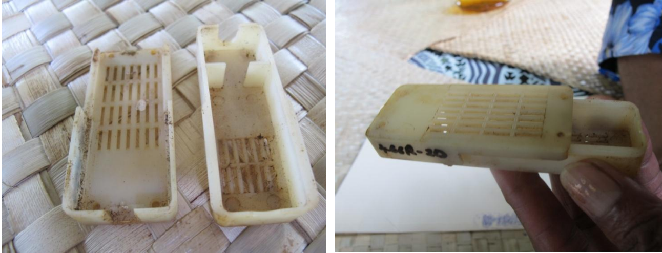
Above: Cage for the Queen bee.