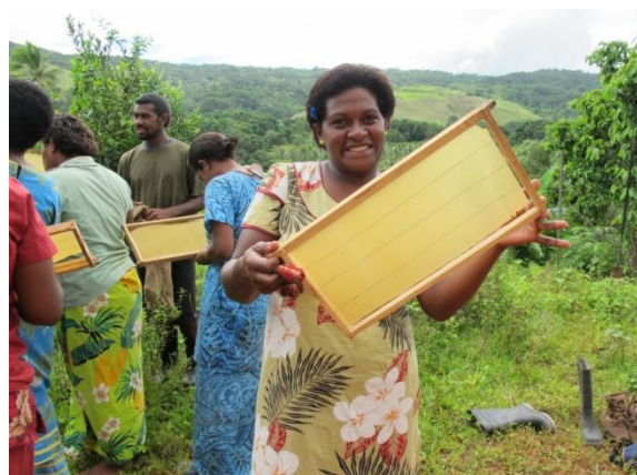
Above: Participants feed the frames with wax using a car battery.