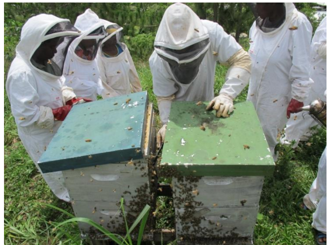
Above left: Inspecting a frame in search for the Queen Bee.