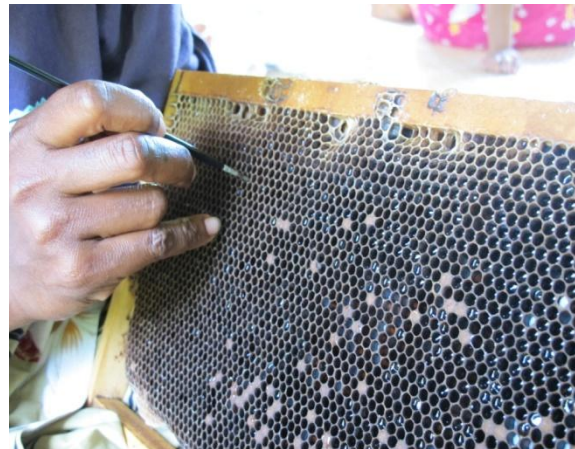
Above left: Cells provided for Queen Bee larvae.