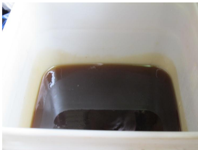
Above: Kavula honey from the harvest in late August 2013.

Quality of honey begins with the hive. The Kavula honey can be considered to be an organic honey since its nectar source is free from pollution and the hives are far from the main road and cane belt area. Most of the honey of the Western Part of Viti Levu tastes and smell like molasses resulting from bees collecting nectar from burnt cane fields. Light brown honey which is 100% sealed has generally better quality than dark honey.