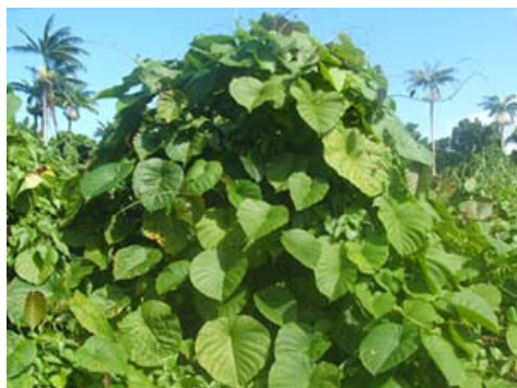
Merremia peltata is a vine that strangles vegetation and invades forest strands.