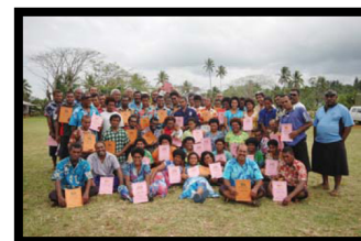
(Top left) Transferring bees to a new hive. (Top right) Participants assembling a new hive. (Bottom left) Participants observing bees around them. (Bottom right) Participants of the two day workshop organised by MORDI.