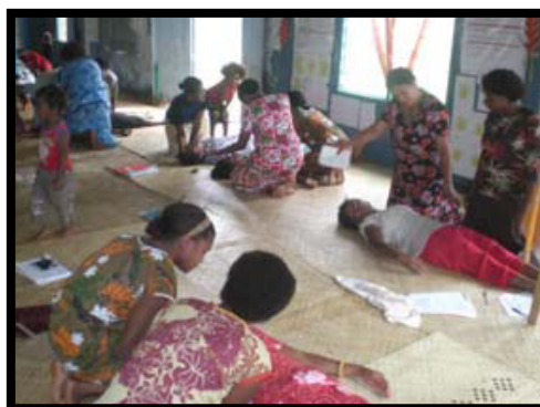
Participants of the training practicing first aid.

The course was planned to meet 4 outcomes: (1) providing basis for continuing education for community members; (2) creating employment opportunities; (3) creating tourism awareness; and (4) training community workers/developers. "The training was offered to the youths of Kubulau as a way to offer them a path back to education. They did not have to have