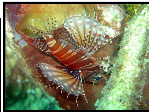
Beautiful juvenile lionfish spotted in Nasue MPA.