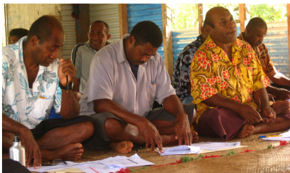
The participants of the consultation meeting in Raviravi.

Also presented at this meeting was proposed structure for the KRMC sub-committees. This governance structure proposes KRMC together with village reps to set up 5 committees to help increase community involvement in resource management activities and to provide a focus for key management activities. The proposed sub-committee are: resource management; science; community development and finance; education; and communication.