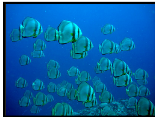
School of batfish in Namena MPA.