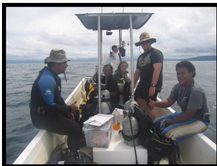
The WCS marine team taking a rest during a surface interval.

created from satellite imagery covering the Kubulau qoliqoli in order to provide recommendations for new sites to add to the existing MPA network. WCS is working with a team of students at James Cook University in Townsville, Australia, to identify potential new MPA sites that are both rich in fisheries resources and biodiversity, but at the same time minimize costs to fishers when those areas are declared no-take. These results will be presented back to the community later to discuss options for adaptive management.