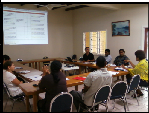
Representatives from Non Governmental Organizations (NGOs) discussing the Kubulau Ecosystem Based Management (EBM) plan in Suva.

Community actions for tilapia and many other treats for the Kubulau terrestrial, freshwater, estuarine and coastal, and marine habitats are listed in the Kubulau EBM plan. Once finalized, copies will be distributed to all the communities.