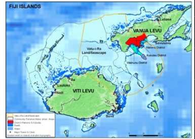
Map of Vatu-I-Ra group where the upscaling effort will be concentrated.

forests, mangroves, seagrass meadows, reefs, deep channels, and seamounts is one of the Pacific's last great wild places. It is home to the largest population of nesting hawksbills in Fiji as well as green and loggerhead turtles. It is one of the few remaining sanctuaries for the highly prized but globally endangered humphead wrasse, which animates the reef alongside bumphead parrotfish and white tip reef sharks. Local people thrill to frequent sightings of resident pilot whales and dolphins as well as humpback whales passing through on their annual migrations. Strong currents run through the deep Vatu-i-Ra channel, nourishing a magnificent diversity of more than 300 species of corals. These, in turn, sustain breeding colonies of frigate birds, black noddies, and red-footed boobies.