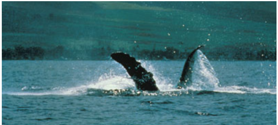
A humpback whale emerging out of the water.