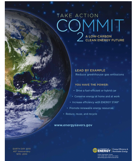
The official 2010 Earth Day poster

Earth Day 2010 coincides with the World People's Conference on Climate Change, to be held in Cochabamba, Bolivia, and with the International Year of Biodiversity.