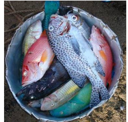
Foodfish such as groupers and emperors need to be managed sustainably so that it can continue to provide income to both communities and government.

The sustainable fisheries management efforts by Kubulau communities were highlighted and acknowledged at this symposium.