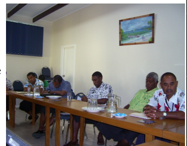
Participants of the EBM plan template presentation.