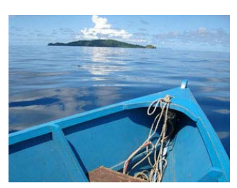
Namena Island and MPA as seen from Kubulau qoliqoli .

Stakeholders including WCS. It is one of many projects towards providing the community with small business opportunities. Village visits and associated activities can generate income for community projects, thus bringing more direct benefit to Kubulau from the Namena MPA whilst protecting the marine ecosystem upon which the tourism relies. KRMC administer admission fees to Namena MPA.