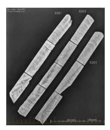
Coral core x-rays showing bands deposited by the corals.

pieces from 3 corals from Kubulau were taken to the Australian National University to be x-rayed. Two of the corals were collected from reef near the Yanawi River mouth and the other was collected near Namena. The results are currently being analysed which will show how the water quality has changed over time. Once the analysis has been completed, EBM Kubulau Bulletin will report fully.